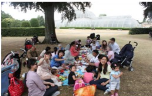
July Outing to Kew